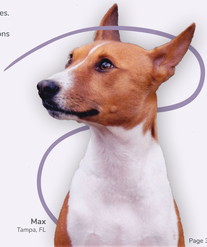
Max Tampa, FL