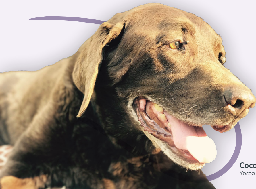
Coco Yorba Linda, CA

Cover Photo: Bailey, Woodbridge, VA