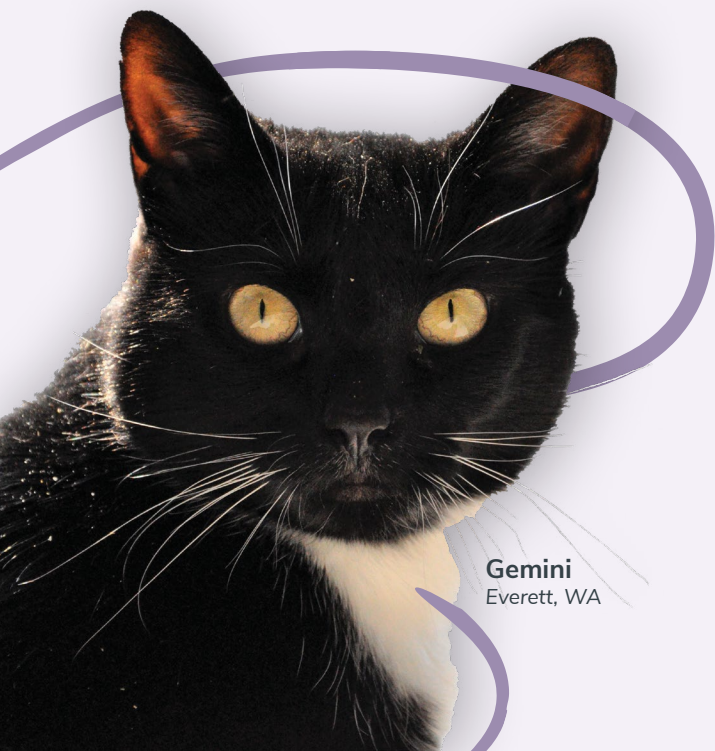
Gemini Everett, WA

As the pioneers in end-of-life care, we seek to actively educate and share our vast reserves of knowledge with other veterinary professionals and pre-professionals, providing critical information that is not taught in veterinary schools. This has substantially contributed to the growth of a new culture of veterinarians, doctors who are learning to treat death not as a failure of medicine, but as the natural progression of biology.