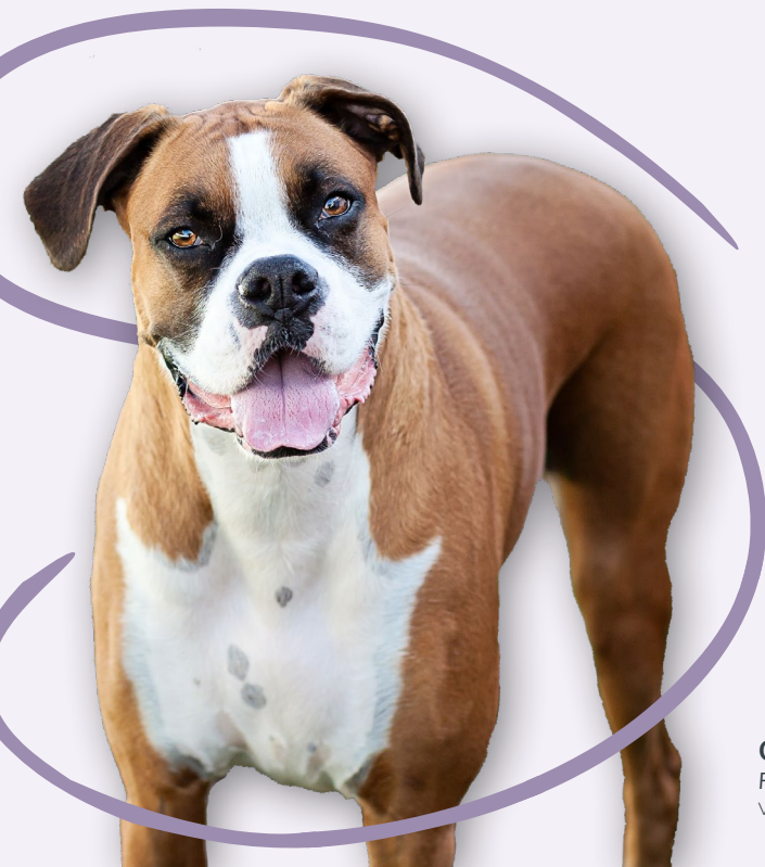
Coco Franklinville, NJ