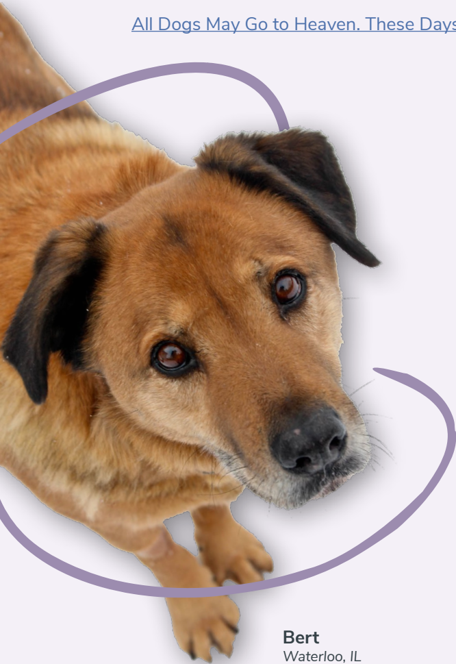
Bert Waterloo, IL